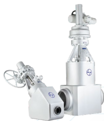
Pressure-seal Bonnet Valves ASME B16.34