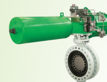
Triple-offset Butterfly Valves API 609 CatB