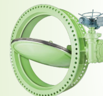
Fabricated Steel Valves AWWA C 504, C 516, EN 593