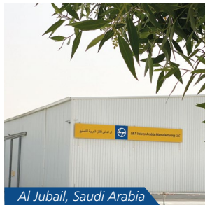
Al Jubail, Saudi Arabia