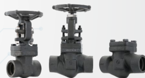
Small-bore Valves API 602, ASME B16.34