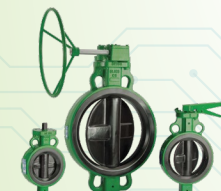
Elastomer-lined Valves API 609 CatA, EN 593