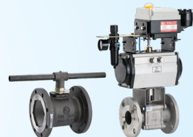
Floating Ball Valves ISO 17292, API 608, API 6D