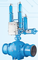
Trunnion-mounted Valves - Side-entry API 6D