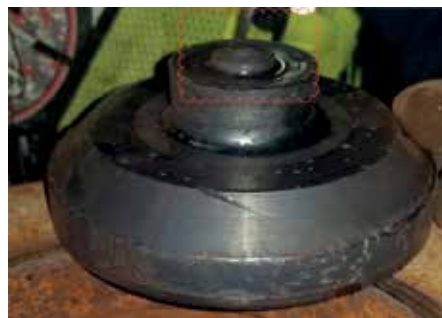
Figure 1. Swing check valve disc stud failure caused by chattering