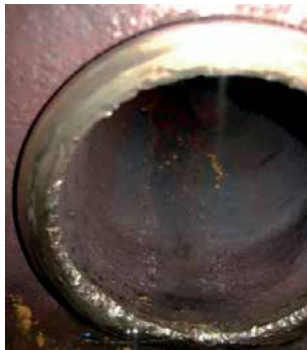
Figure 2. Seat damage caused by chattering