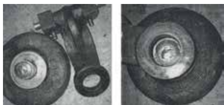
Figure 4. Disc stud damage

In a 12-inch Class 900 check valve installed in an offshore platform, the disc stud got sheared due to repeated contact of the disc against the stopper (see Figure 4). The analysis revealed that the disc material selected for the check valve was a martensitic stainless steel (CA15), which has low impact strength and could not withstand the impact loading. Here, the CA15 disc was replaced with carbon steel material, which is more ductile than C15, extending the life of the check valve.