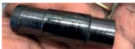
Figure 3. Undue wear of hinge pin in a swing check valve due to chattering

The wear of the hinge pin in Figure 3 was noticed before it caused any mechanical failure. This highlights the need to monitor the condition of check valves in critical services at regular intervals, where the flow velocity cannot be maintained above V Min .