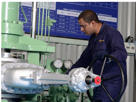
Valve Refurbishing and Testing